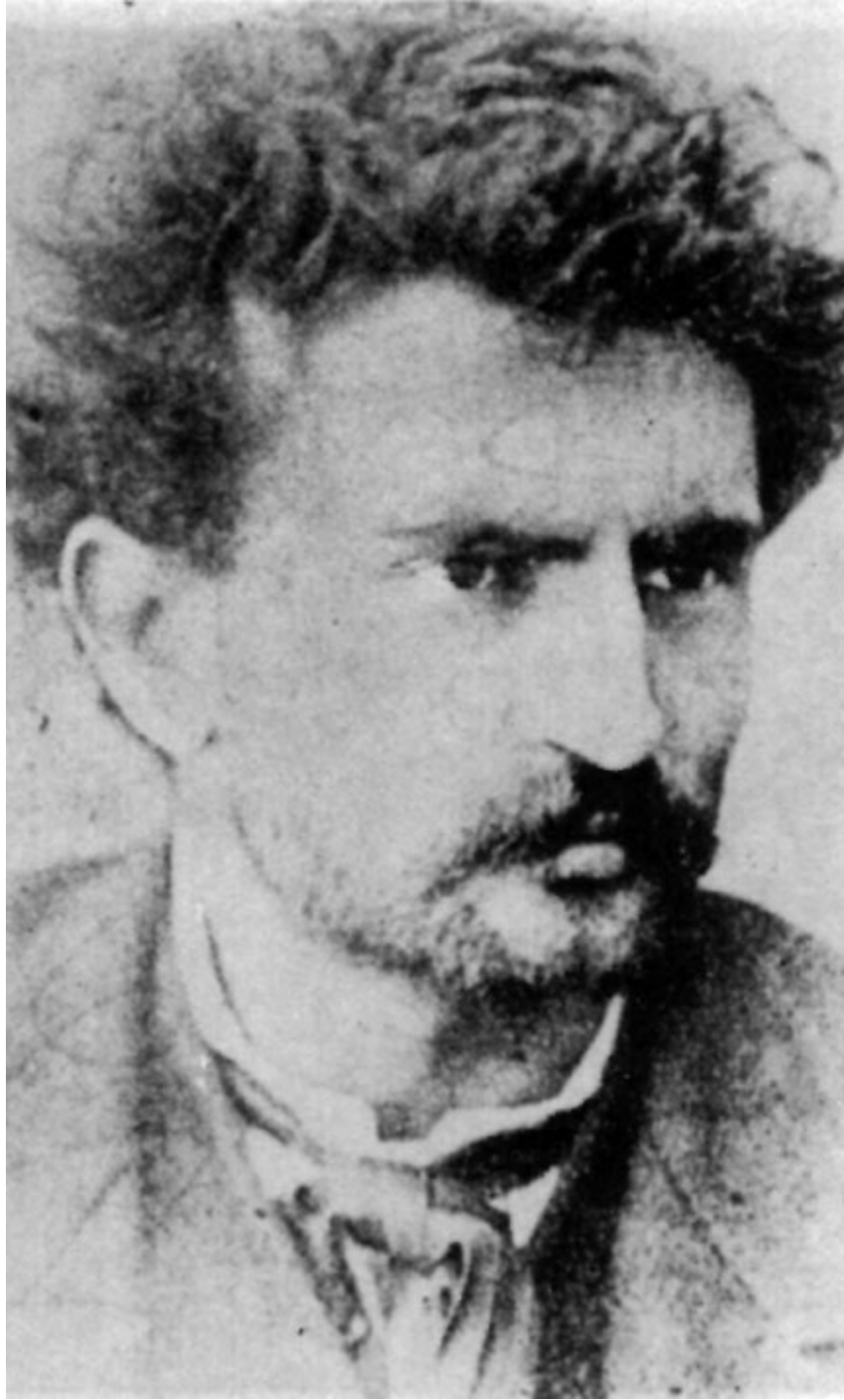
A young Errico Malatesta