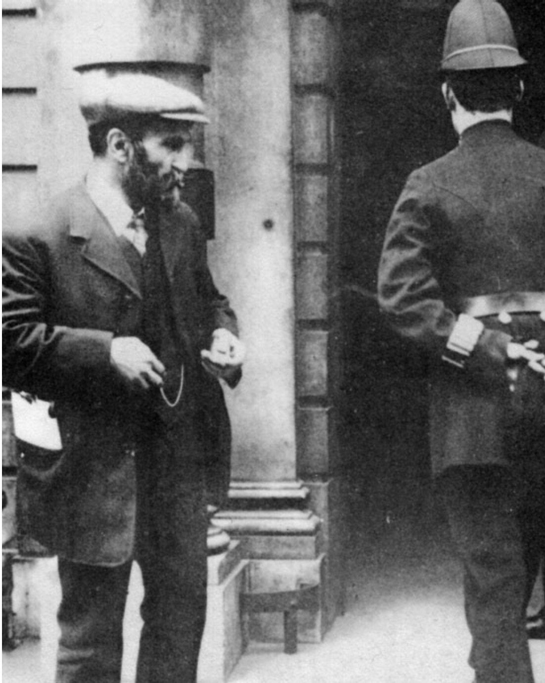
Malatesta outside Bow Street Police Court London (1912) where he appeared on a criminal libel charge. He was awarded a three month prison sentence and recommended for deportation. The deportation order was quashed as a result of an energetic campaign in the radical press (notably Lansbury's Daily Herald and the Manchester Guardian ) and by the workers' organisations culminating in mass demonstrations in Trafalgar Square.