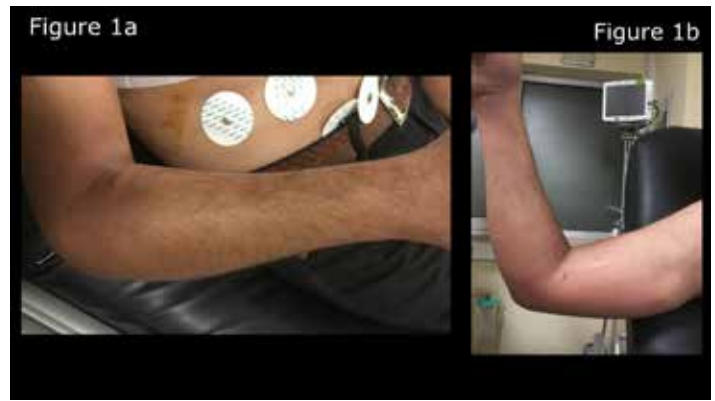
Figure 1a. Redness and swelling are seen at the entrance of the peripheral intravenous cannula in the right arm; 1b. It appears that the redness and swelling reach up to the axilla of the right arm

Bedside ultrasound for assessment of heart revealed a severely reduced left ventricular systolic function, biatrial dilatation and pleural effusion (Figure 2 a, b, c). Bedside ultrasound for vascular assessment of upper extremity revealed thrombophlebitis at the cephalic and basilic veins and UE-DVT at the subclavian, brachial and axillary veins (Figure 3). On thoracic CT angiography, there was no pulmonary embolism, while pneumonic infiltration and consolidation were determined in the upper lobe of the right lung, together with bilateral pleural effusion. The patient was hospitalized. No Mycobacterium tuberculosis